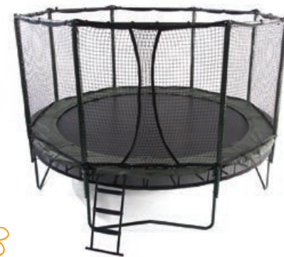
Octagon Kit Added protection & even stronger enclosure!