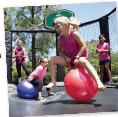
Hoppy Fun Balls Saddle Up and Go BIG!