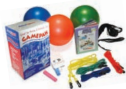
Game & Party Pak™ Instant fun! Just add kids!