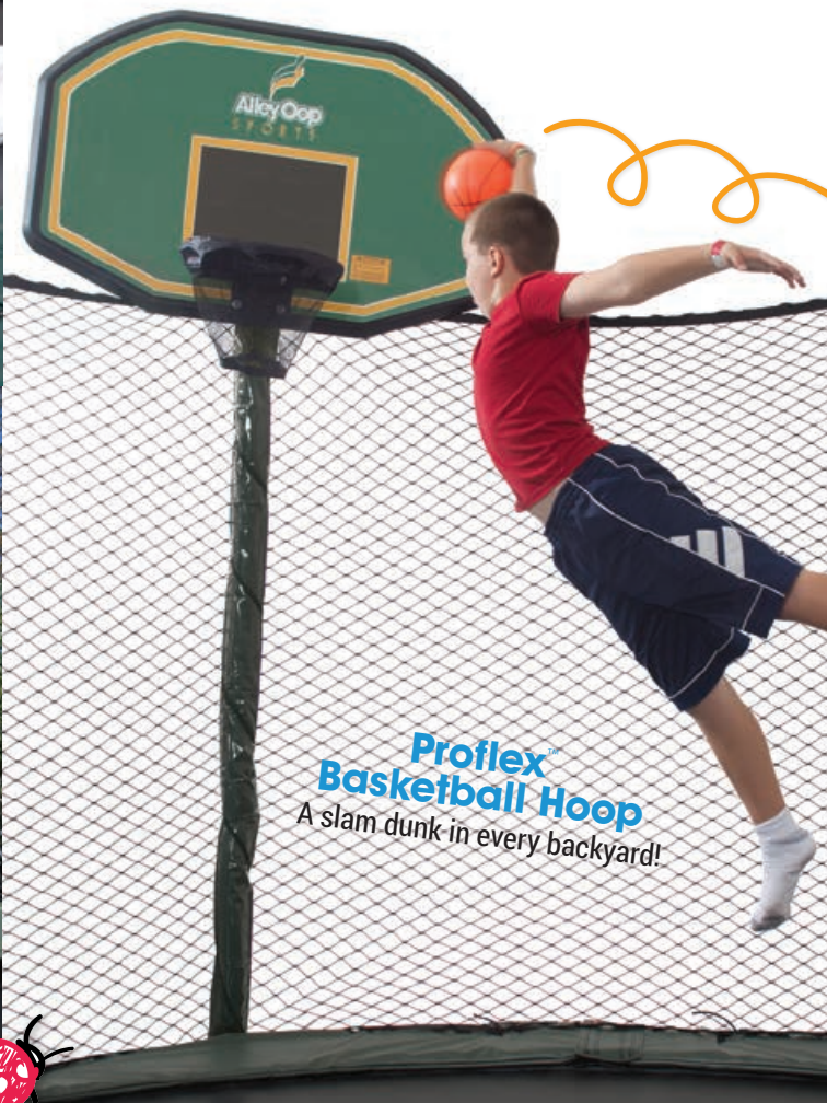
Proflex™ Basketball Hoop A slam dunk in every backyard!