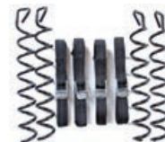
Anchor kit Keep your trampoline grounded!