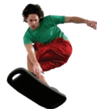
BounceBoard Extreme™ Catch Big Air! Snowboard & Skateboard