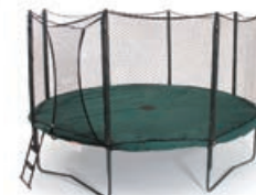
Weather Cover Heavy Duty with UV Protection