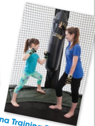
Arena Training Equipment Hiya! A Fun Martial Arts Accessory