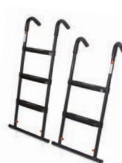
Sure Step™ Ladders Step up to the FUN!