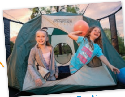
Outback Tent™ Backyard Campouts!